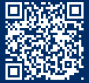
Community Budget Guide

To view additional resources, use your device to scan these QR codes or visit our website, www.fhps.net .