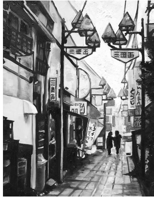
"Nakano Side Street," Silver Key Award Grace Whalen