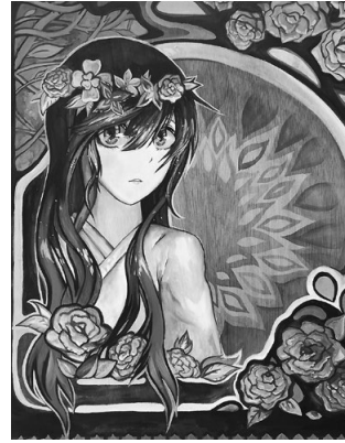
"Art Nouveau Tokyo," Silver Key Award Grace Whalen