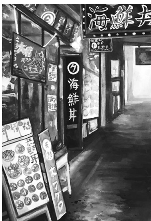
"Tsukji Market," Silver Key Award, Grace Whalen