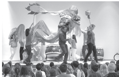
Meadow Brook Elementary School students witnessed a dragon dance.