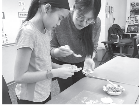
A Northern Trails 5/6 student receives instruction on how to make Chinese dumplings.

academic, linguistic, and cultural experience for students.