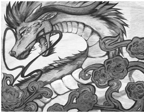
"Wooden Dragon," Honorable Mention Grace Whalen