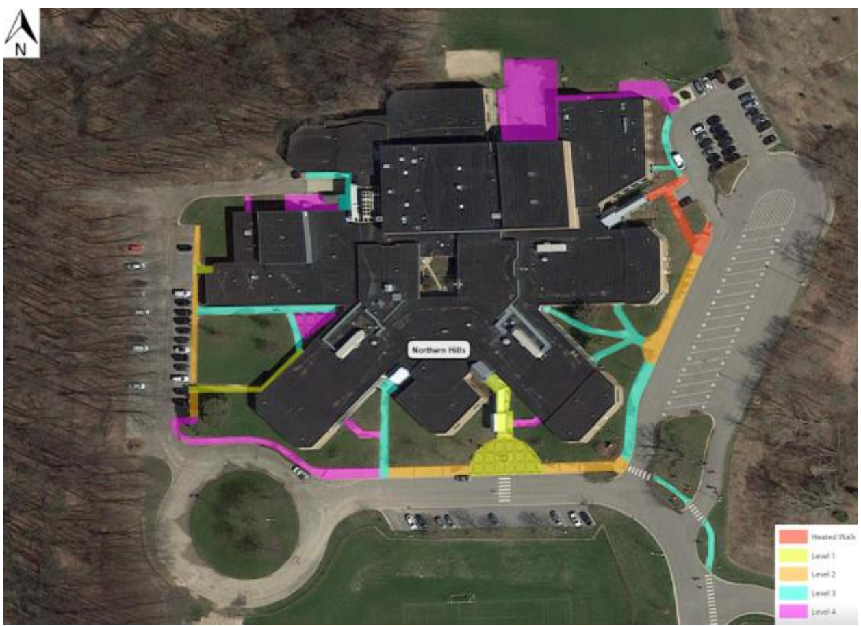
Northern Hills Middle School: Sidewalk Snow Removal