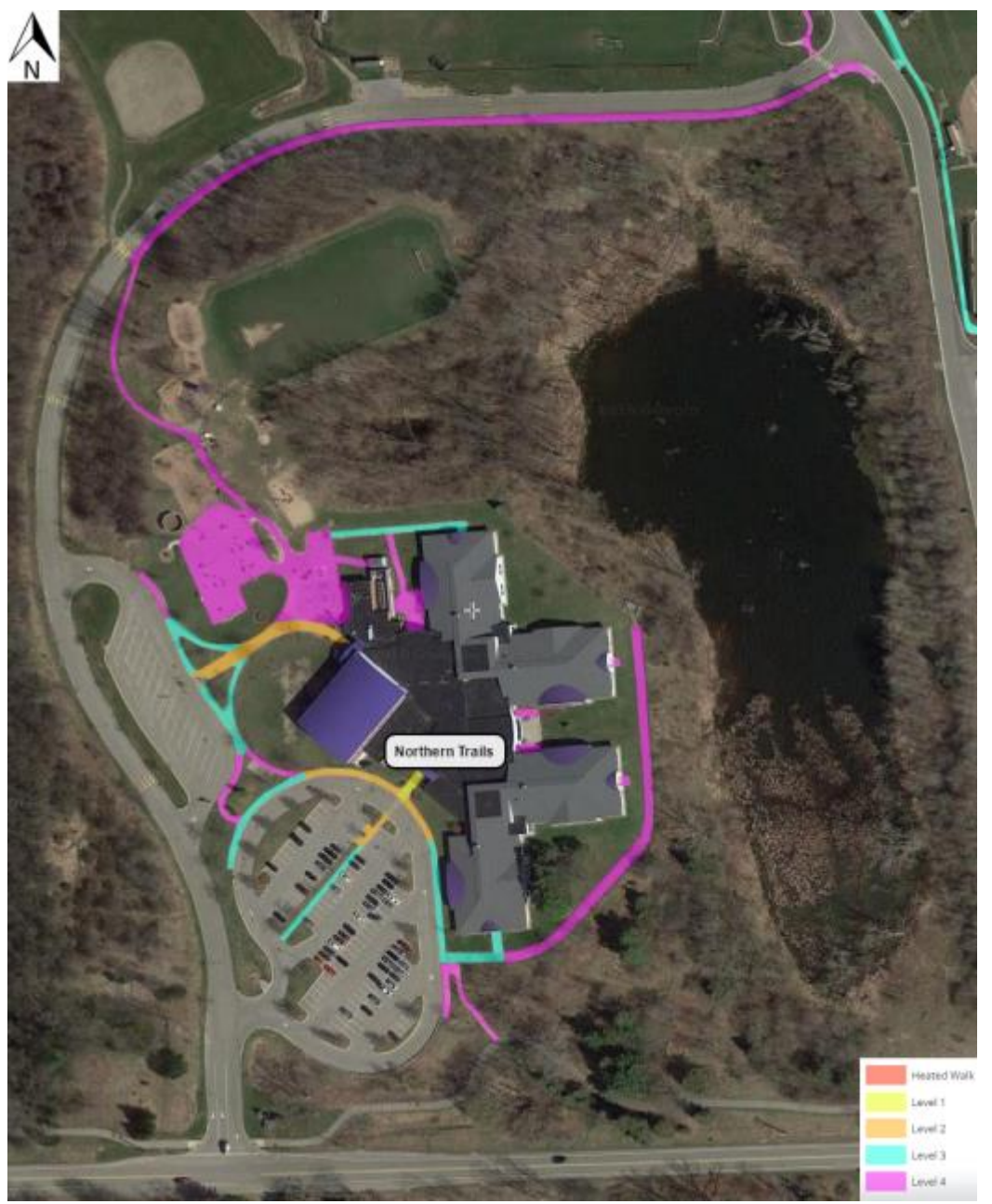
Northern Trails 5-6 School: Sidewalk Snow Removal