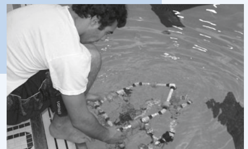
Engineering Technology: Robotic Innovations