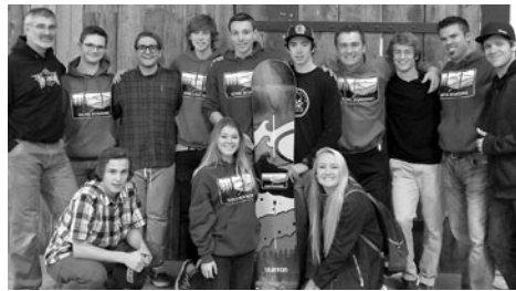
Forest Hills Eastern "Gone Boarding" students and instructors visit the Burton Snowboard Company to share their ideas and discuss possible partnering opportunities.

With the winter months upon us, we're all constantly busy and running from here to there. Although winter months bring extra time to spend with family and friends, they can also be a time of stress, anxiety and depression. Being realistic, planning ahead, taking a break and seeking support can help. Forest Hills Public Schools is committed to helping every learner achieve, and we have professionals working to address all areas of a learner's mental health and well-being.