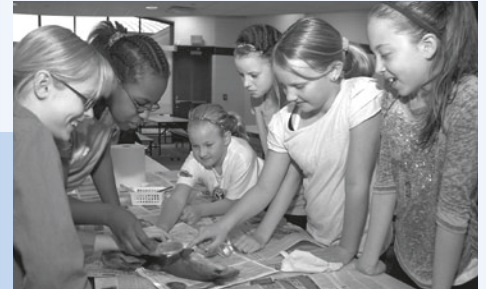
Biology: Dogfish Shark Dissection

We fund/support exceptional learning opportunities such as: