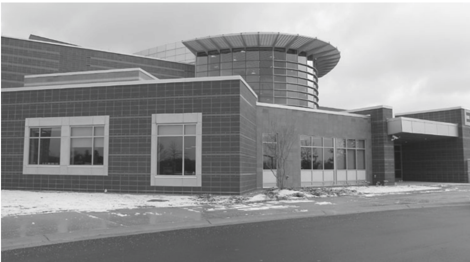
The Forest Hills Eastern Middle School and High School building addition features a secure entrance for all persons entering the facility as well as high school administrative offices.

To see a list of completed projects and those targeted for 2015 and 2016, visit the district's website: www.fhps.net .