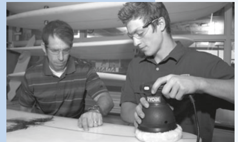
Industrial Arts: Sport Boards Development