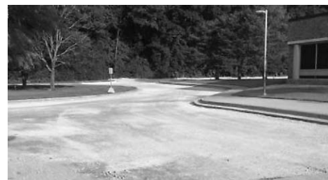
Northern Hills Middle School's parking lot was resurfaced this summer. The old asphalt was removed, the base was leveled and compacted (shown here), and then new asphalt was installed.