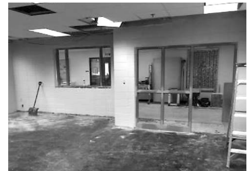
Construction progress was made this summer in Northern High's STEM program room. It will be ready when school starts.

Thank you Forest Hills residents for your continued support of the district's goal to preserve district assets the community has invested in, and maintain a quality learning environment for our students. To learn more about other projects that have been accomplished due to the passage of the 2013 bond, visit the district's website: www.fhps.net .