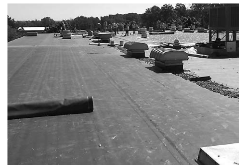
A crew works to repair and upgrade Central High School's roof.