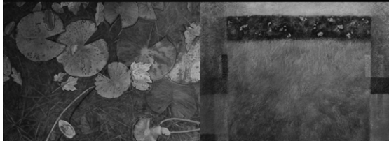
REUSCH & KRIEGBAUM