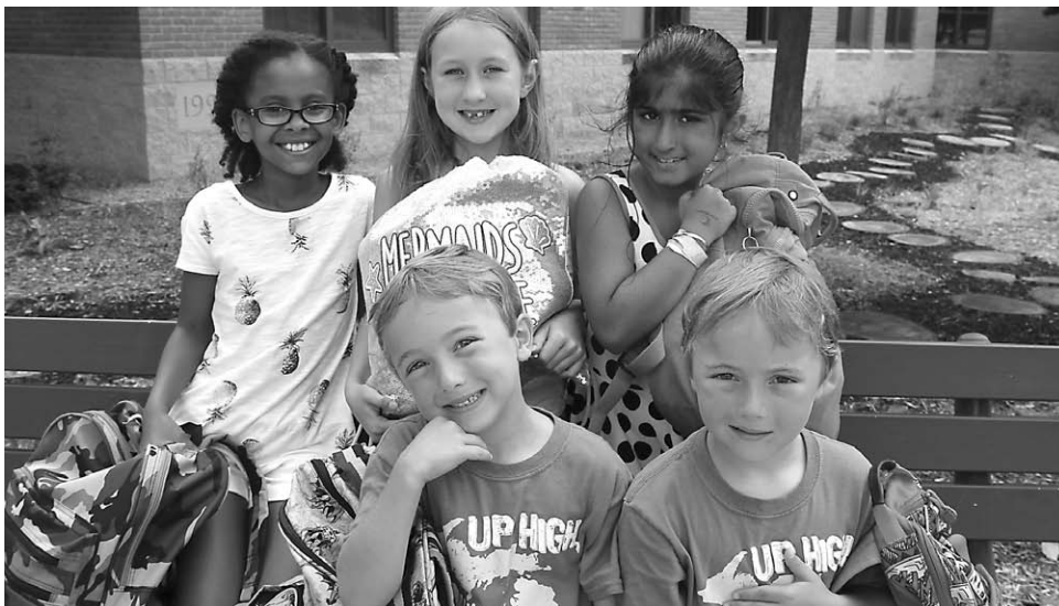
The students from this issue's cover photo have their backpacks ready for new school supplies. Suggested school supply lists and important back-to-school events and dates can also be found online on each building's web page.