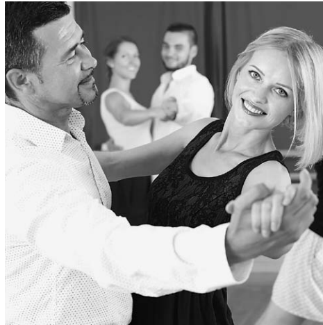
Ballroom and Latin Dance: Beginning Students is just one of the many enrichment classes for adults this fall.

Other returning favorites such as volleyball, basketball, soccer, fencing, Minecraft, web and mobile video game development, ballet, drawing, and LEGO building classes