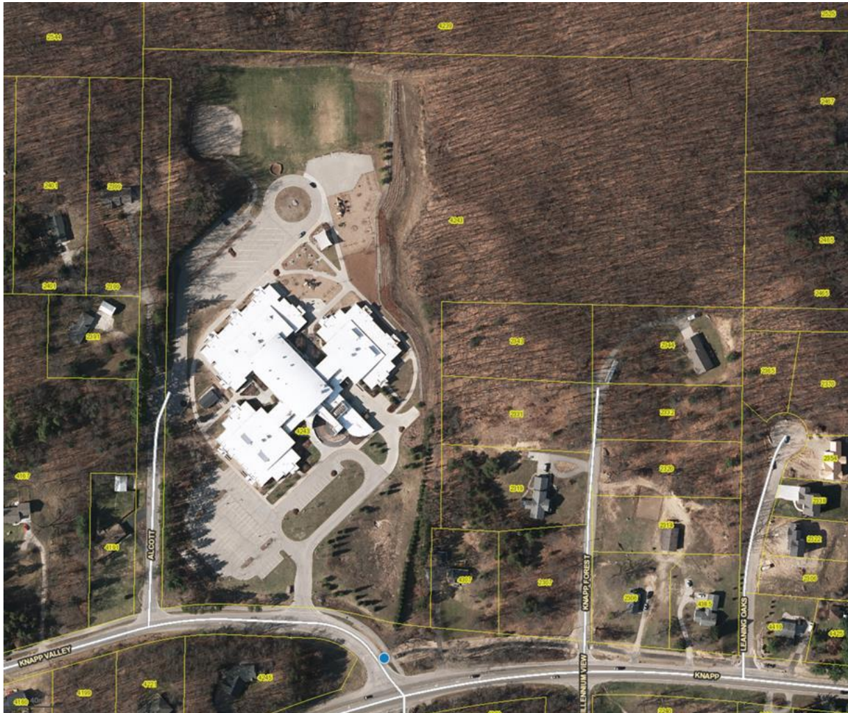
Knapp Forest Elementary Aerial Image

Knapp Forest Elementary is located at 4243 Knapp Valley NE. It operates as a kindergarten through sixth grade program serving approximately 680 students.