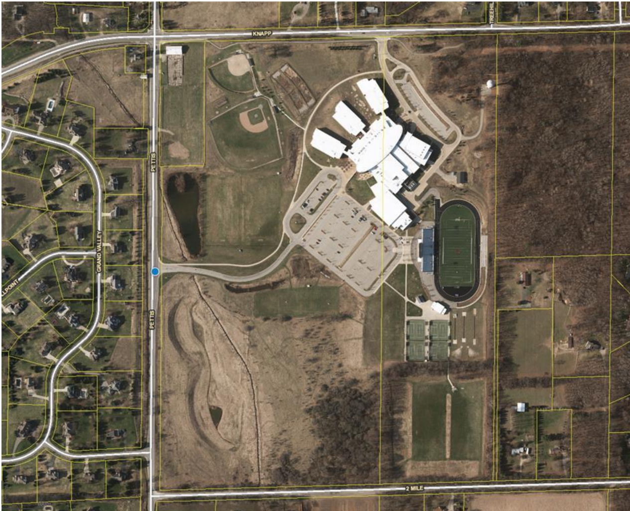
Eastern Middle/High Aerial Image

Eastern Middle/High is located at 2200 Pettis NE. It houses both a middle school (seventh and eighth grades) and a high school (ninth through twelfth grades) serving approximately 1,200 students.