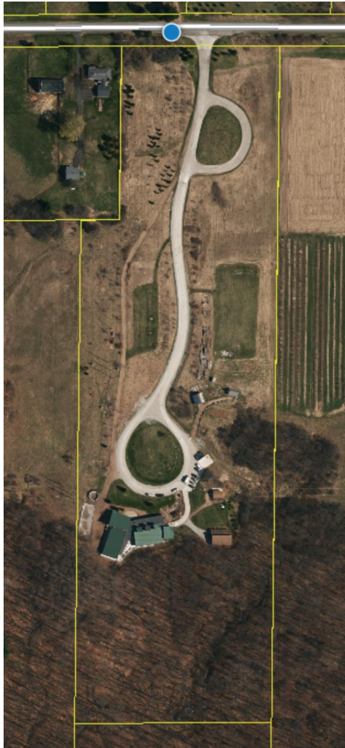
Goodwillie Aerial Image

Goodwillie Environmental is located at 8400 Two Mile Rd. NE. It operates as a 5-6 themed program serving approximately 100 students.